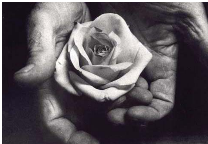
Photograph: Gardener Hands

People with dementia usually lose the ability to express bodily discomfort or pain. Staff will need to watch for signs of unexpressed pain. Appropriate pain medication should be given to the person as ordered by the physician.